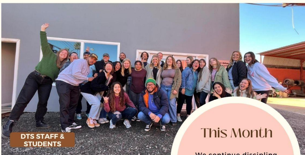
DTS STAFF & STUDENTS